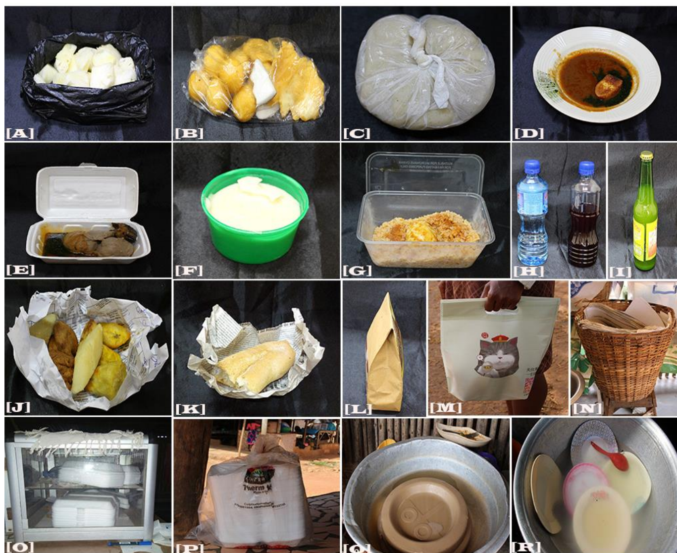
Figure 1. Main types of primary food packagings used on the Abomey-Calavi campus. [A, B, C]: Non-biodegradable plastic packagings; [D, M]: Non-biodegradable reusable composite packagings; [E]: Non-biodegradable and single-use polystyrene packagings; [F, G, H]: Reusable non-biodegradable plastic packagings; [I]: Reusable glass packaging; [J, K, L]: Biodegradable paper packagings; [N, O, P]: Some methods of packages conditioning; [Q]: Wash water of reusable packagings; [R]: Rinse water of reusable packagings.

material because of its lightness, malleability, impermeability, aesthetics, resistance, rigidity, flammability and above all its excellent quality/cost ratio (Madam, 2003). These properties are transferable to plastic food packagings. In Benin Republic, the population continues to use non-biodegradable plastic packagings because of (i) their low cost (from 0.009 $), (ii) their accessibility (available everywhere, market, kiosk, shop, etc.) (Figure 1A, B), and above all, their very low availability of biodegradable plastic food packagings or any other types of ecological food packaging.