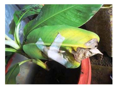
Inoculation with pin prick plus spore suspension spray