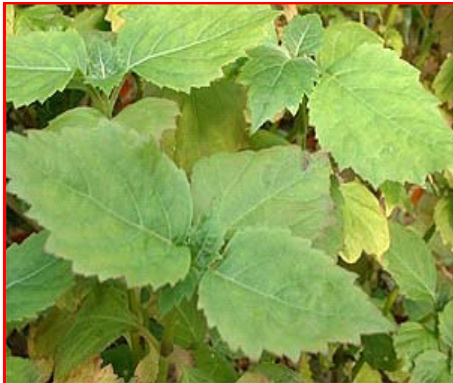
Figure 1. Pogostemon parviflorus Benth.

screening of medicinal plants for antimicrobial activities and phytochemicals is important in finding potential new compounds for therapeutic use. This paper reported the results of a survey that was done based on folk uses, by tribal people, with bioassay test for anti- Candida activity.