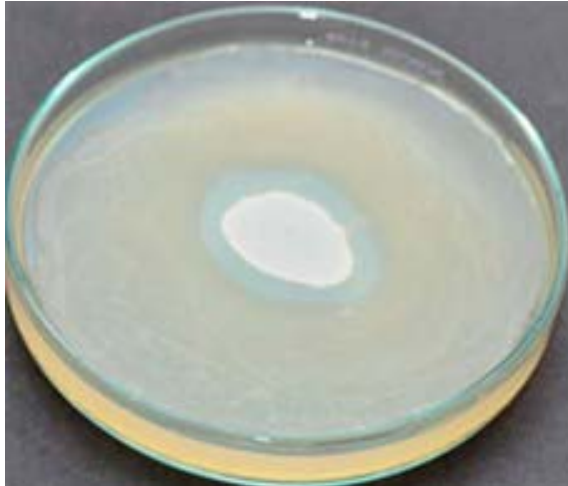
Figure 1. Plates showing zones of inhibition against Staphylococcus aureus .