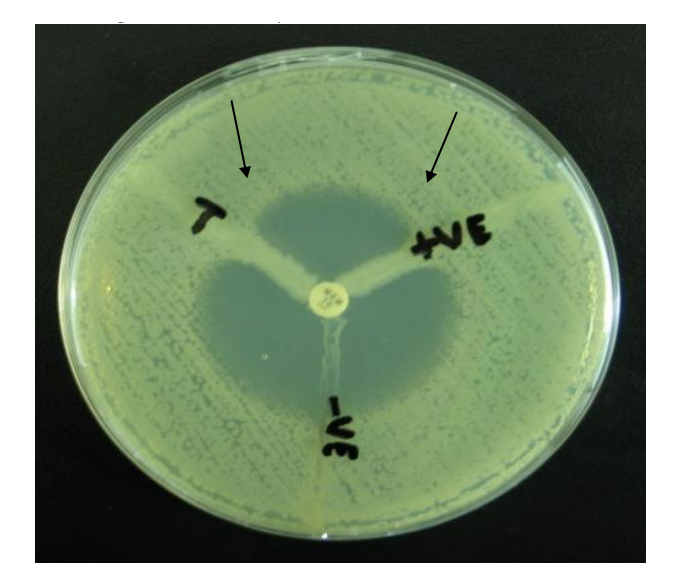
Figure 1. Demonstration of MHT. The MHT plate shown contains a lawn of carbapenem susceptible E. coli (ATCC 25922). A meropenem (10 \mu g) disc was placed in the center of plate. Positive control ( E. cloacae ), negative control ( Sphingomonas paucimobilis ) and test organism has been streaked from the edge of disc to the edge of the plate. Arrows indicate the clover-leaf like indentation indicating the production of carbapenem.