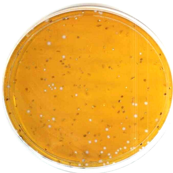
Figure 1. The morphology of L. acidophilus (narrow arrows, brown colonies) and L. rhamnosus (wide arrows, white colonies) in fermented milks stored at 4°C. MRS pH 6.2 agar plus clindamycin (MRS C) was the media used for enumeration of L. acidophilus .

1 For further details refer to Table 1, 2 Two types of colonies were evident, but easily distinguishable. L. acidophilus presented small and brown colonies while L. rhamnosus showed large and yellow colonies. Counts are mean of eight readings, that is, N=8.