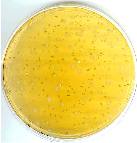
Figure 2. The morphology of L. rhamnosus (wide arrows, yellow colonies) in fermented milks stored at 4°C. MRS pH 6.2 agar plus vancomycin (MRS V) was the media used for enumeration of L. rhamnosus .