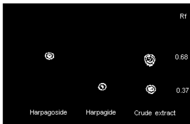
Figure 1. Quantitative thin layer chromatography of H. procumbens extract with harpagoside and harpagide reference standards. Harpagoside R_f 0.68; Harpagide R_f 0.37; Mobile Phase: butanol, acetic acid and water (12:3:5). Harpagide spots appeared reddish upon spraying with 1% vanillin in ethanolic sulfuric acid spray reagent.