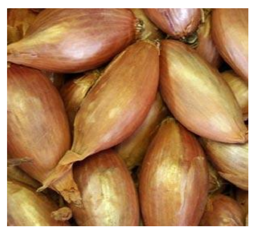
Figure 2. A. hirtifolium corms.