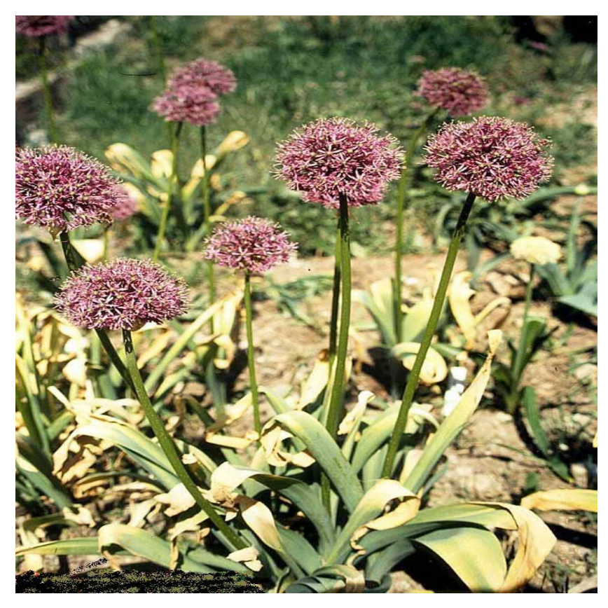
Figure 1. Allium hirtifolium Boiss (Wild Garlic).