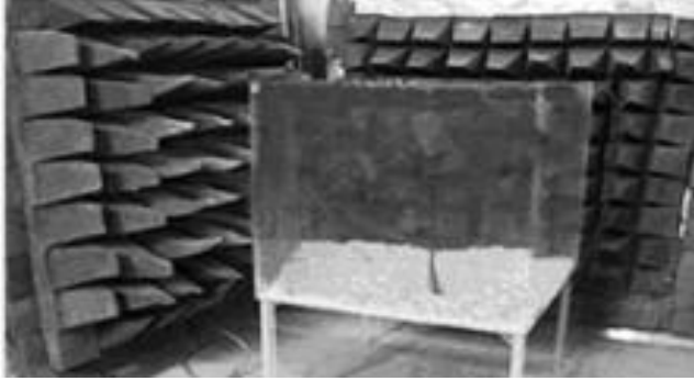
Figure 1. Schema of the facility (cage) for exposure of rabbits to 950 MHz magnetic field.

(Alasdair, 2009). In our past research, the influence of 950 MHz magnetic field (mobile phone radiation) on sex organ and adrenal functions of male rabbits was valued (Sarookhani et al., 2011). This study was an attempt to introduce the effects of non-ionizing 950 MHz microwave mobile phone exposure to hematological biomarkers in an animal (rabbit) model and expanding these findings to human model. To our knowledge, there are few authors dealing with the issue of 950 MHz EMF exposure with two power intensities (3 and 6 W or speaking and non-speaking conditions) in laboratory conditions.