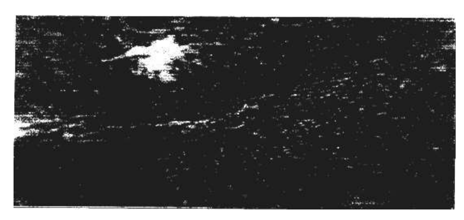
Figure 2. Liver shows mild peripotal and perivascular lymphocytic infiltrations (x 400).