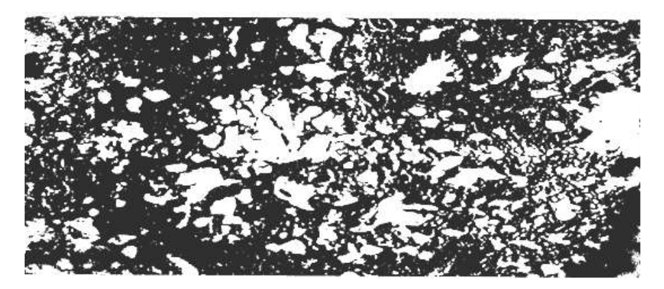
Figure 3. Kidney shows no visible lesion (x 400).