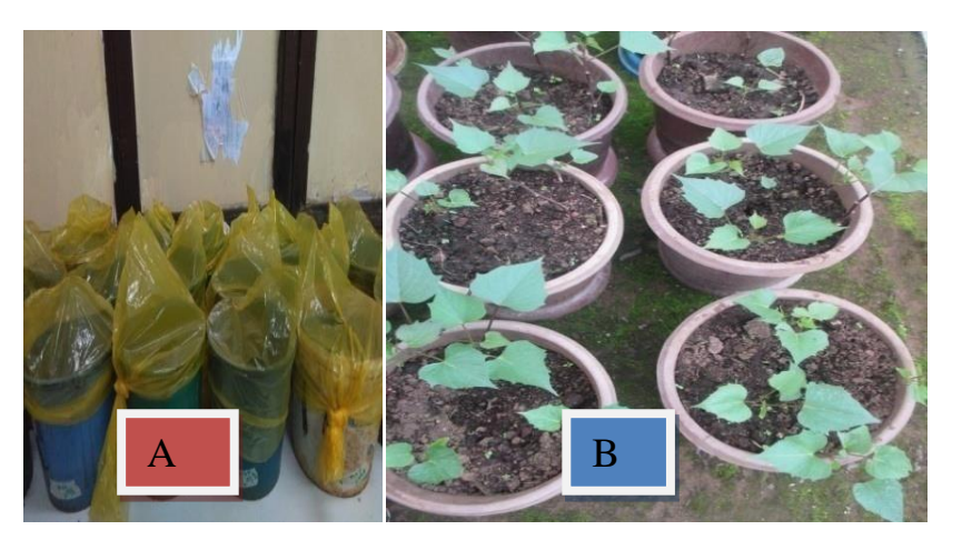
Figure 4. Acclimatized plantlets of Kulfo variety in the greenhouse. A) Plantlets covered with plastic bags (1<sup>st</sup> week of acclimatization). B) Acclimatized plantlets after one month in greenhouse.

Although, statically no significant difference was observed among 0.5 mg/l BAP and ex vitro rooting, but higher root length response were recorded at ex vitro rooted plantlets. About 84% of the in vitro rooted plantlets were acclimatized successfully, whereas, 93% of the ex vitro rooted plantlets survived and acclimatized successfully. Therefore, 0.5 mg/l BAP for shoot initiation, 1 mg/l BAP of shoot multiplication and directly transferring to soil for rooting was recommended for micropropagation of Kulfo sweet potato variety.