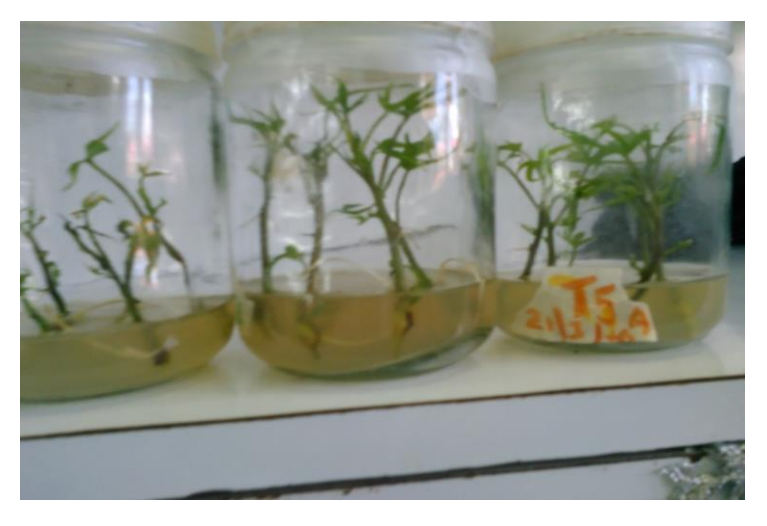
Figure 2. In vitro shoot multiplication of Kulfo genotype on MS medium containing 1.0 mg/l BAP after 5 weeks of culturing.

BAP=Benzyl Amino Purine, Means with the different letter in the same column is significant different at 0.01 probability level. Values are mean \pm SD.