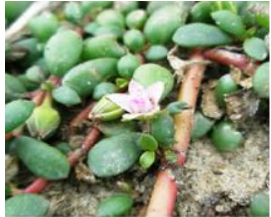
Figure 11. Sesuvium portulacastrum (Family: Aizoaceae) an important seashore beautiful medicinally important plant.