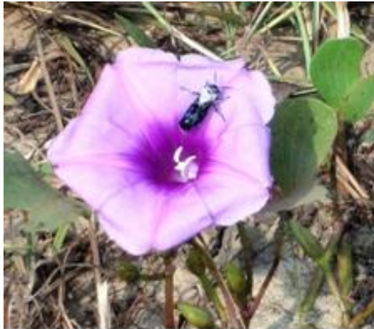
Figure 3. Flower of Ipomoea pes-caprae with pollinating agent.