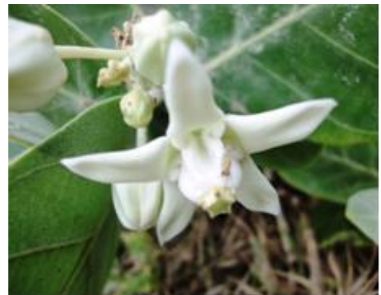
Figure 12. Calophyllum inophyllum oil yielding plant in the sea shore areas.

of the investigated taxa was done using thin layer chromatography(TLC).DC-Alufolien Kieselgel 60 aluminium sheet (Merck) were used for performing TLC, according to the methods described by Sadashivam and Manickam(1996). It has been observed that dominant present of proline may take a vital role in stress tolerance (Table 4 and Figure 13).