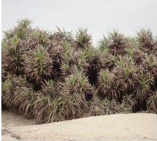
Figure 8. Effect of warm air blow on Pandanus fascicularis .