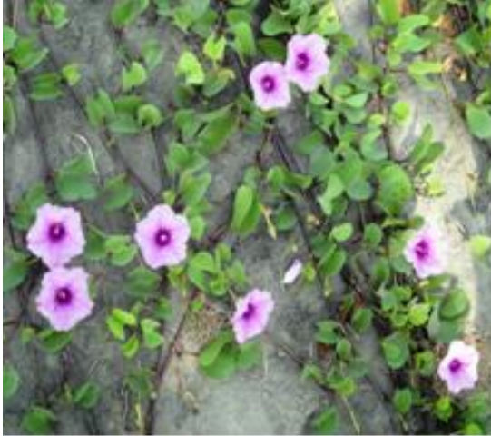
Figure 2. Mat formation I.pes-caprae with beautiful flower at Puri-Konarak Marine drive.