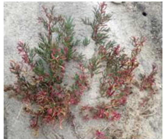
Figure 7. Salicornia perennis , very common in the sea beach.