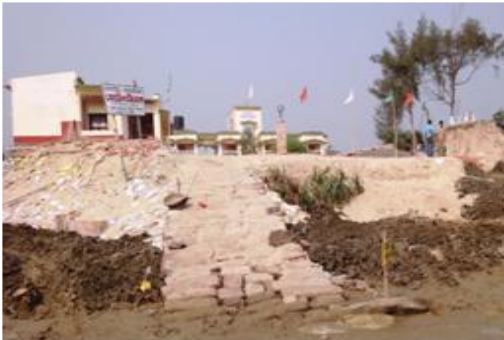
Figure 15b. Construction of hotel destroying dune flora.

and roots of different colonizer species like Ipomoea pes-caprae etc are useful for gonorrhoea, rheumatism, skin