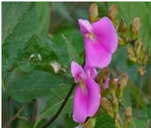
Figure 9. Cannavella lineata an economically edible important sea shore bean.