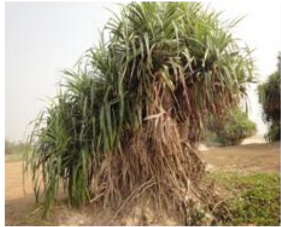
Figure 6. Pandanus fascicularis secondary mangrove plant important soil binder.