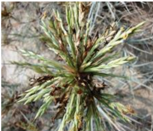
Figure 4. Flower of Spinifex squarossus at Mandermoni, West Bengal.