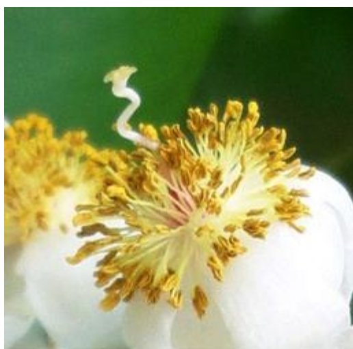
Figure 13. TLC plate showing qualitative analysis of free amino acid of different parts of I. pes-caprae .