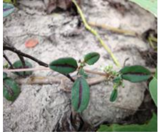
Figure 5. Important sea shore plant Gisekia pharnaceoides (Gisekiaceae).