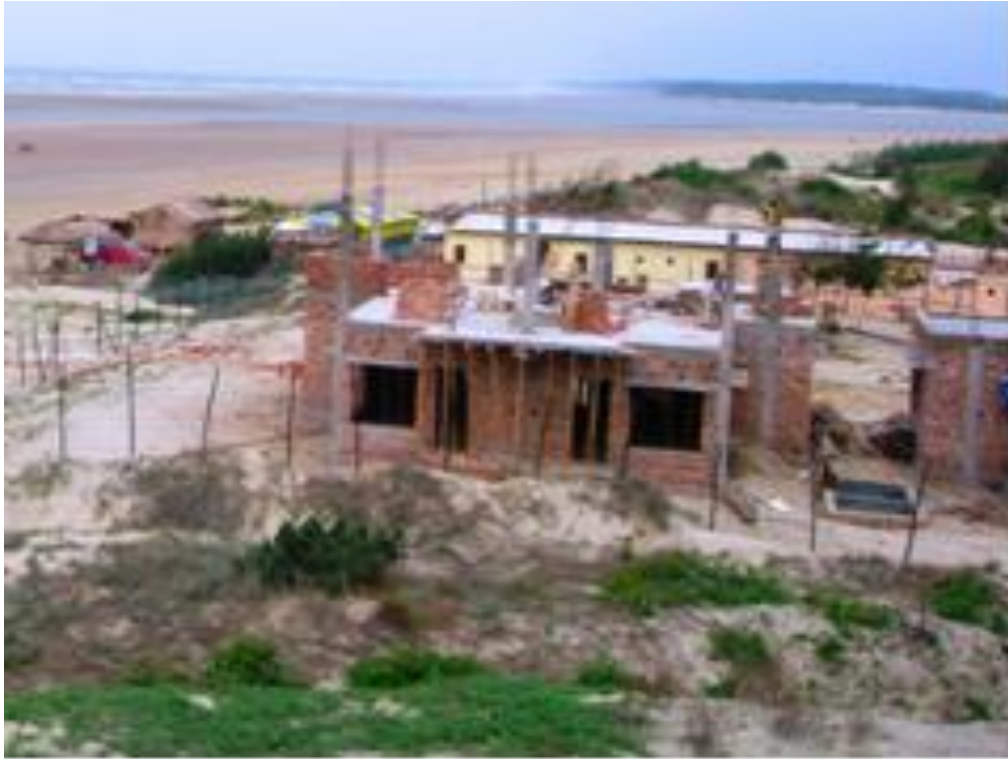
Figure 15a. Construction of hotel which has continuous destroying dune vegetation.