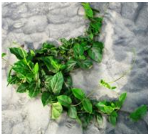
Figure 10. Tylophora indica an important sea shore plant having high medicinal value.