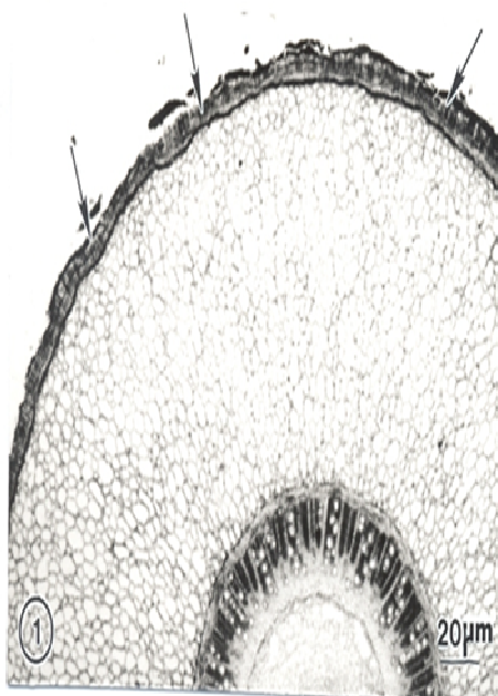
Figure 1. Transverse section of segment of pneumatophore of A. marina , showing damage to outer wall layers of cork sheath (arrows).