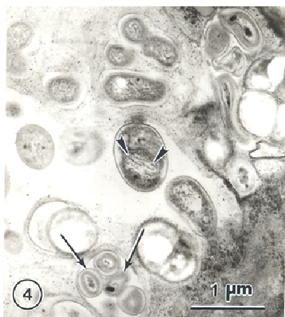
Figure 4. Adhesion of bacteria, probably a result of mucilage surrounding the cells (arrows). Note spiral arrangement of membranes within some bacterial cells (arrowheads).

bacteria, which occur either singly or in colonies.