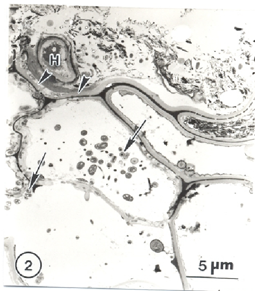
Figure 2. Damaged and underlying cells invaded by bacteria (arrows). Note algal holdfast (H) closely appressed to thick cell wall (arrowheads).