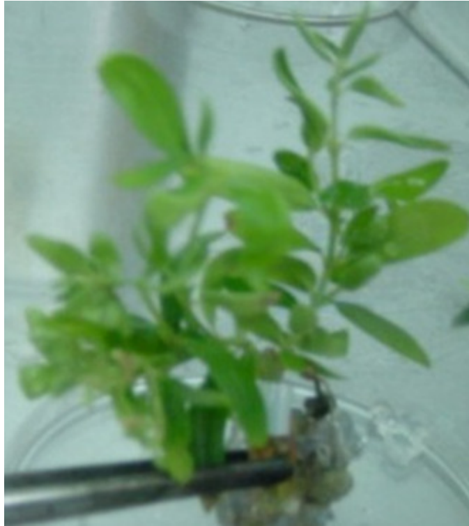
Figure 2. Elongation of microshoots and proliferation capacity grafted plantlets.