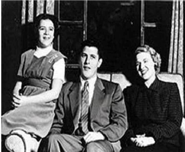
Figure 1. Barack Obama's mother and her parents.