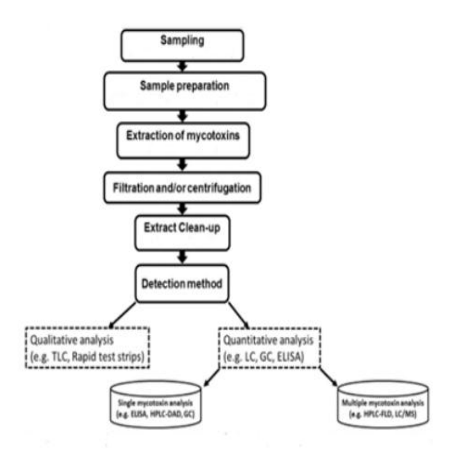
Figure 4. Common steps in mycotoxin analysis.

technologies-flow cytometry, microspheres, lasers, digital signal processing and traditional chemistry. The range of applications is considerable throughout the drug-discovery and diagnostics fields, as well as in basic research. Microspheres are dyed to create 100 distinct colors. Each microsphere has a 'spectral address' based on red/infrared content. The suspendable microspheres are coated with capture reagents such as antibody or oligonucleotides. Sample is then added to microspheres and the analyte is captured by the microspheres. A fluorescent reporter tag is then added and results are read using a compact microsphere analyzer. The advantages of the technology are: high speed, high throughput, multi-analyte detection, versatility and reproducibility.