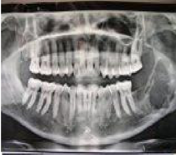
Figure 1. Orthopantomograph showing a unilocular radiolucent lesion in the ramus of left jaw. The inferior border of the lesion is scalloped.