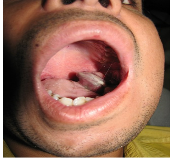
Figure 2. Intra oral photograph depicting exophytic growth in the junction of the left pterygomandibular fossa region and buccal mucosa.

good anatomic barrier (Stolovitzky et al., 1994). Corticosteroids and calcitonin are used for non-surgical management (Terry and Jacoway, 1994; de Lange et al., 2006). The current report highlights a case of recurrent and aggressive form of CGCG in the mandible.