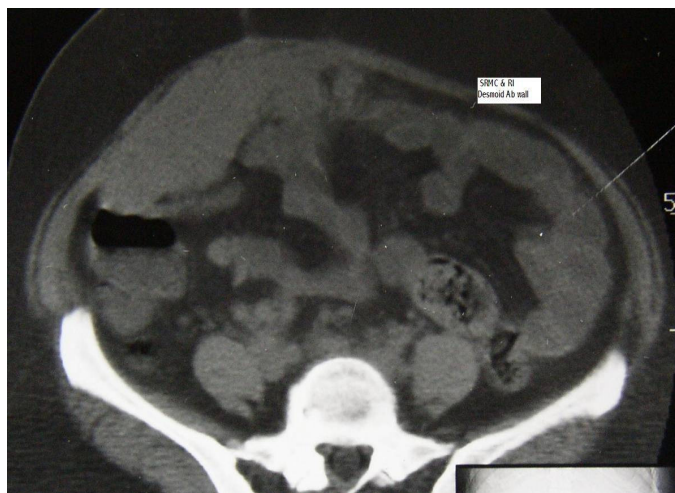
Figure 2. CT shows the mass arising from the right parietal wall of the abdomen.

they can arise from any skeletal muscle (Pack and Ehrlich, 1944). The myofibroblast is thought to be the cell of origin of these benign, but locally invasive lesions (Wu et al., 2010).