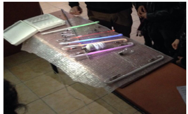
Figure 2. Experimental set-up.

Answers given by the students to the multiple-choice and open-ended questions in the test are examined via a