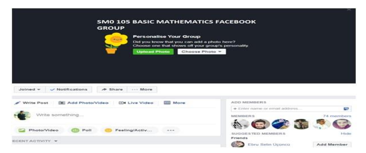
Figure 2. SMO 105 Code Basic Mathematics Facebook Group.