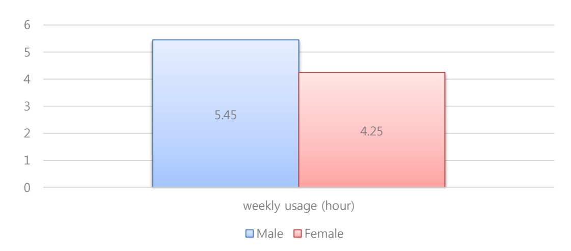
Figure 3. The use frequency of education platforms according to gender factor.

computer technology is that computers are not readily available. Besides, the study of Granger et al. (2002) is parallel to the conclusions of our study. It was concluded that one of the factors affecting technology integration into education is the shortage of materials in schools (Rice and Valdivia, 1991; Branch et al., 1999; Granger et al., 2002; Jochems, Koper; Van Merrienboer, 2004).