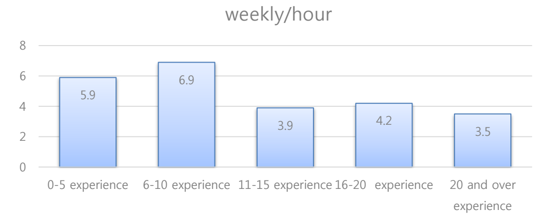
Figure 4. The Use frequency of education platforms according to experience factor.

teaching and for using teaching time efficiently. That's to say, the primary school teachers that participated in the study find education platforms useful and they believe that these platforms have positive impacts on them. Besides, the reasons why they prefer education platforms are their being free, easily accessible and suitable for the students' level, as well as having rich content. In the research conducted by Çağıltay et al. (2001), they found out advantages of using computers in education. In the research done by Odabaşı et al. (2002), it was also found out that web-assisted education offered a rich educational environment to the primary school students in terms of stimulus and embodying abstract concepts. These mentioned results overlap with this research results again.