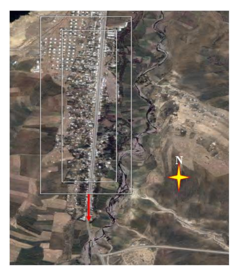
Appendix 1. Transect walk study used in the study area( red arrow indicates the way to Addis Ababa and rectangular white colored lines transect lines considered 500 m far from each other two along the river side and other two transects on the opposite side of the river that pass through Hiwane.