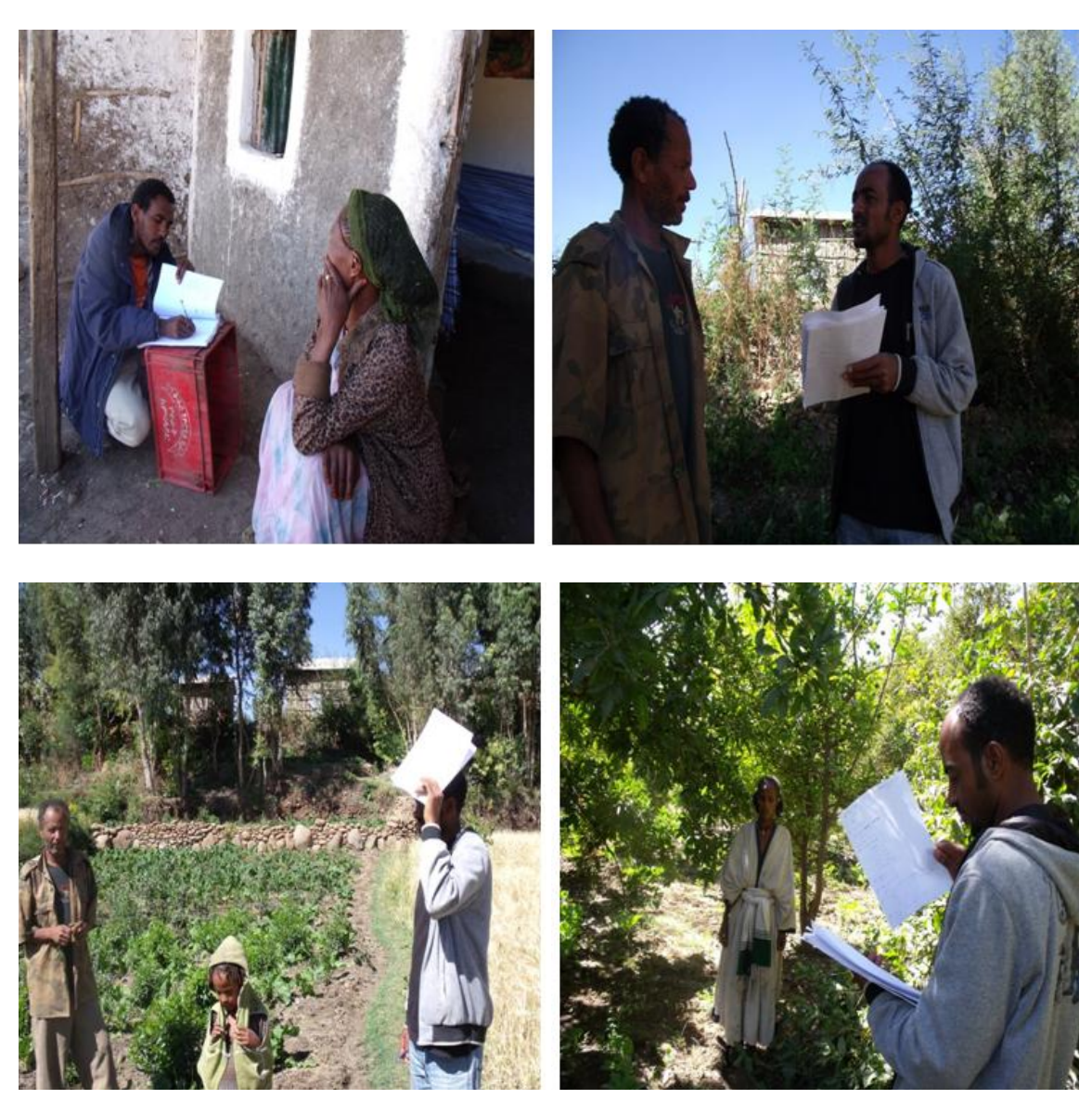
Appendix 3. Some photos during Interview with some of the respondent.