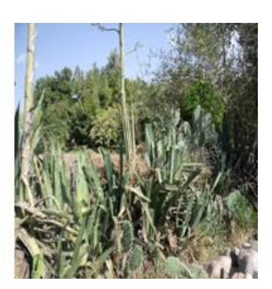
Figure 4. Shembaeta (Rumex steudelii) planted at water canals to protect bank erosion (left and middle) and Agave spp. and Opuntia ficus-indica on the outer margins as reinforcements for fences used in backyard (right).

construction material, as fuel wood ( E. globulus , Acacia etbaica ), sold as food ( Citrus spp, Carica papaya , Psidium guajava , Opuntia ficus-indica , Z. spina-christi , Persea americana , Mangifera indica ) or sold for making drink like Rhamnus prunoides (leaves are sold commercially for making beer and "siwa" (local drink)