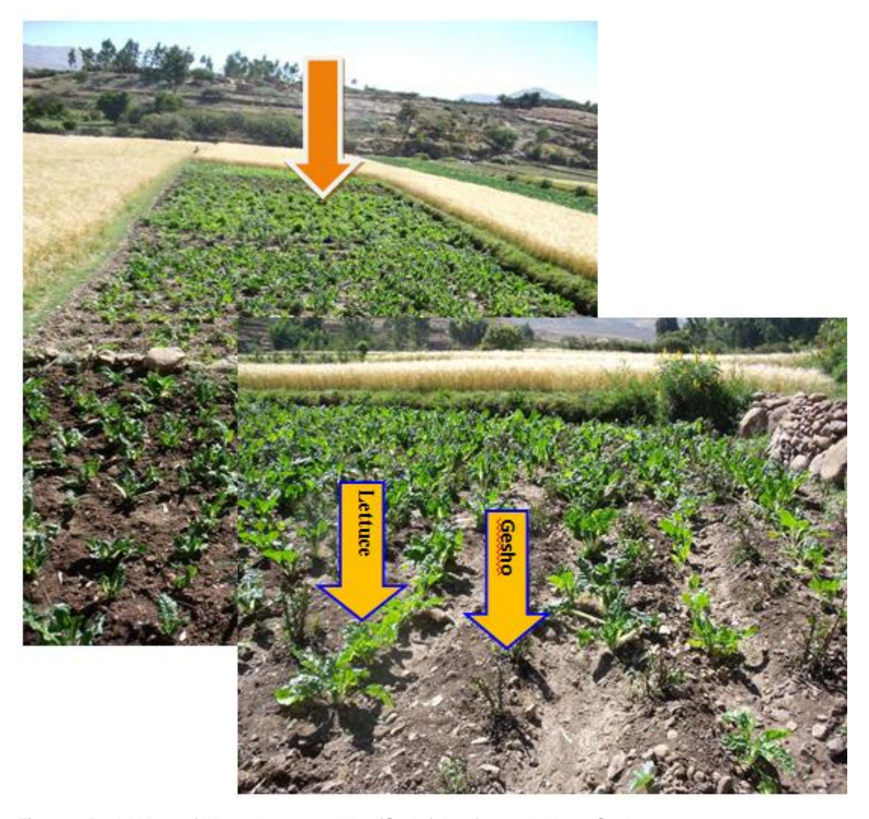
Figure 2. Partial Views of Wheat, Lettuce and Hop (Gesho) Agroforestry in Home Garden