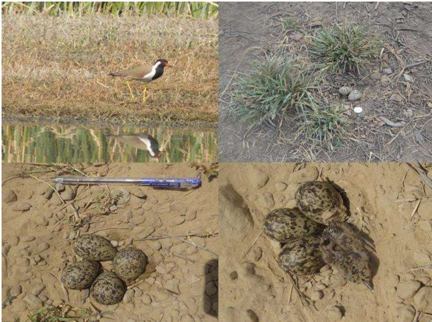
Figure 1. Red Wattled Lapwing with its clutch size and hatched chick in Barren land.

All lapwing nests were found on the ground in the vegetation, which mainly comprised Cynodon dactylon , Ziziphus mauritiana , Albizia procera , Cinncus ciliaris , Cinncus biflorus , Arva jwanica , Eucalyptus cameldulensis , Acacia nilotica , Prosopis juliflora and Conocarpus spp. (Table 1).