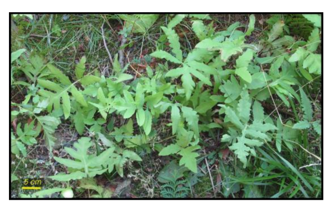
Figure 1 . Onoclea sensibilis growing among other ferns in the sampling site used in this study on Torrey Cliff, Palisades, New York. Scale marker = 5 cm.

(3) To document the rate of photosynthesis of O. sensibilis leaves under varying light intensities, and to determine the photosynthetic compensation point during mid to late July, as evidence of primary productive potential while under climatic stress.