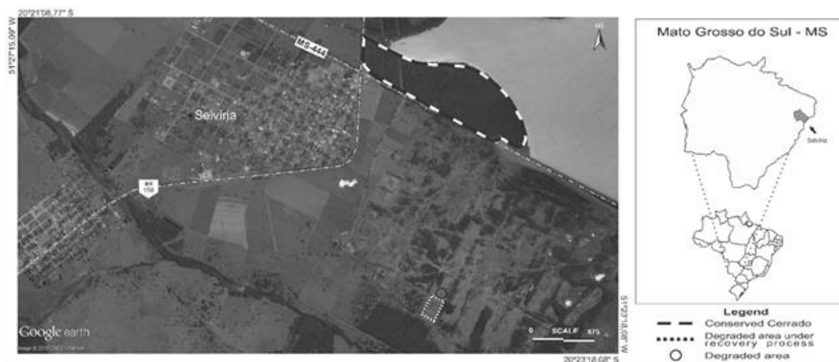
Figure 2. Localization of the sampling sites in the area of Conserved Cerrado. This experimental area is in a natural recuperation process after being exposed to degradation (without any intervention).

experiment, six soil samples per plot were collected, in a depth of 0.0 to 0.2 m. For comparison purposes, samples were also collected in conserved Cerrado and degraded area without intervention. To collect samples in the conserved Cerrado area (without human intervention after degradation in the 1960s) plots of similar size as in the experiment were located. Georeferences and the sampling were made in the same manner. The experimental setup was in randomized blocks with four repetitions. The treatments were as follows: Soil from conserved Cerrado near the