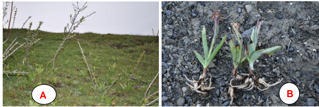
Plate A. Site showing anthropogenic pressure B. Uprooted individuals of D. hatagirea in Suru valley.