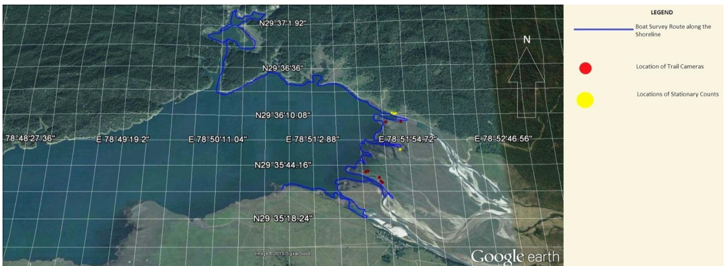
Map 2. Boat survey routes, trail camera locations and stationary count locations.