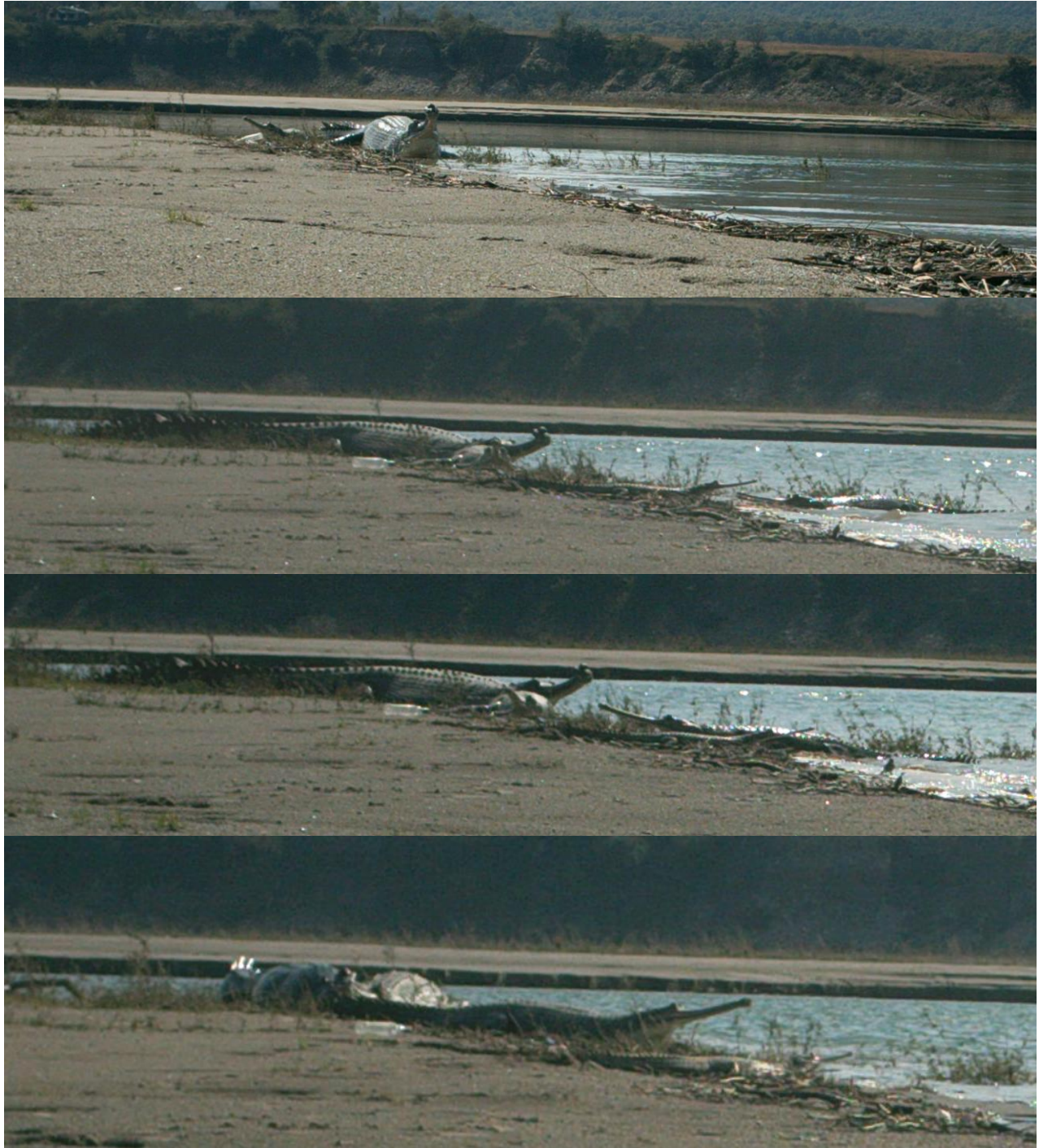
Figure 1. Time Lapse Sequence from a "Trap Spot" of basking Gharial of various size classes, Dhikala, CTR.

conducted by boat thereby reducing disturbances in the study area during surveys and errors that could occur during Direct Counts from Observers (Ogurlu et al., 2013), leading to improved counts at the study site.