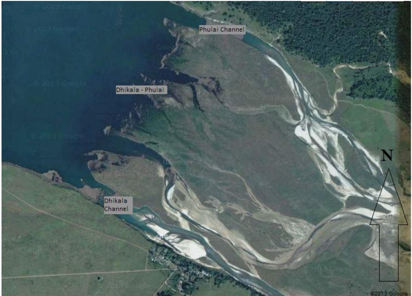
Map 1. Demarcation of Dhikala into three sections for purposes of surveys, CTR.

Single Observer as part of this exercise. Survey routes and field events were recorded on a Garmin 72H GPS unit while photographs for photographic enumeration were taken using a Canon 1000D camera attached to a Celestron Spotting Scope at 20x and 40x magnification. Nikon 10 x 50 Binoculars were used for scanning the area for basking groups and individual basking gharial. While conducting boat surveys along the shoreline we used a 3.8 m inflatable boat fitted with a Torqeedo 1003 s Electric Boat Engine, with low decibels as compared to a petrol engine. Advantages included fewer disturbances to the animals as well as being able to access shallower sections of the shoreline.