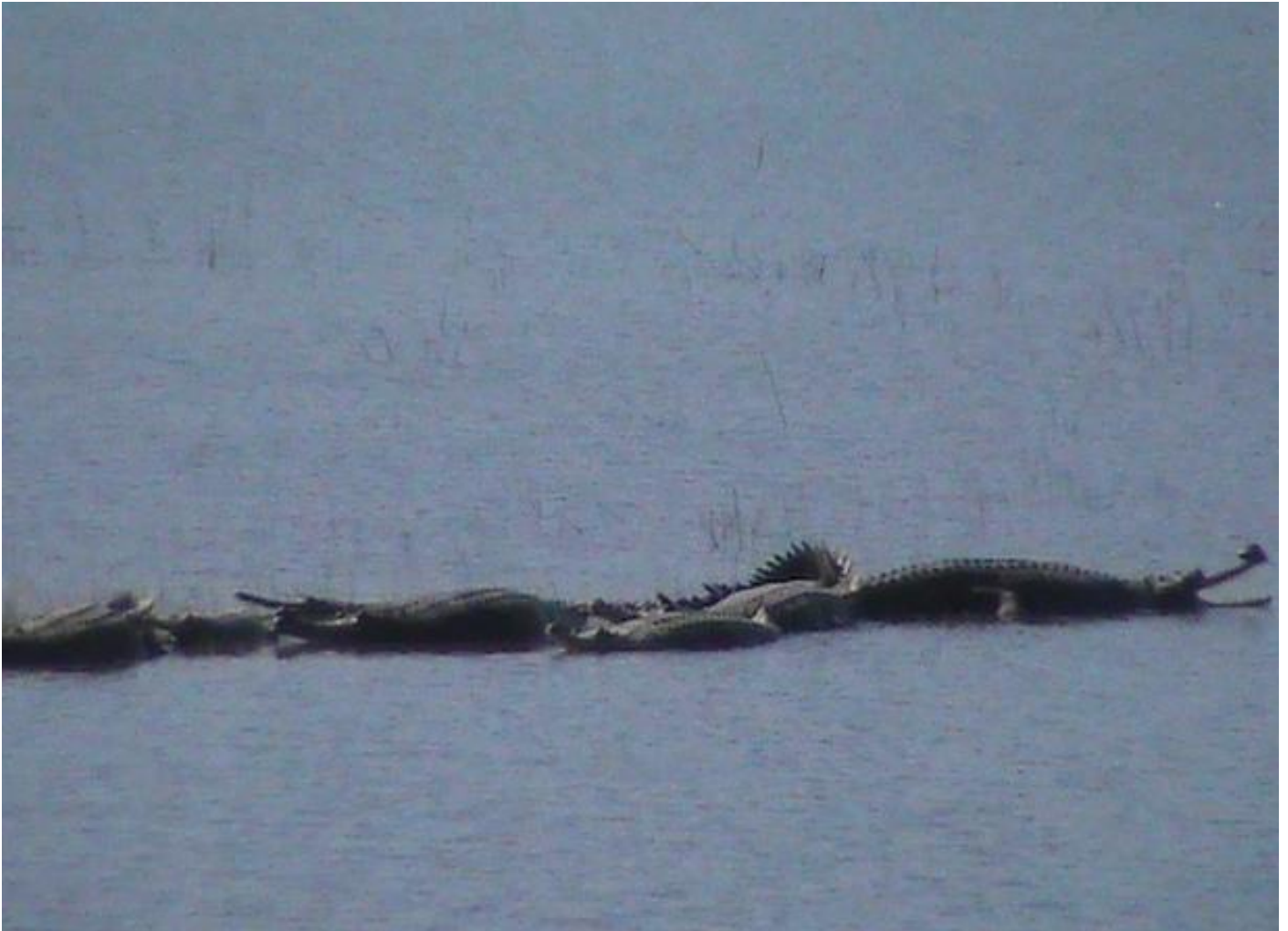
Figure 2. Photo enumeration of a basking gharial congregation in Dhikala, CTR.