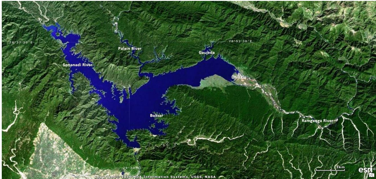
Map 3. Locations of Gharial sub-populations in 2008 at CTR.