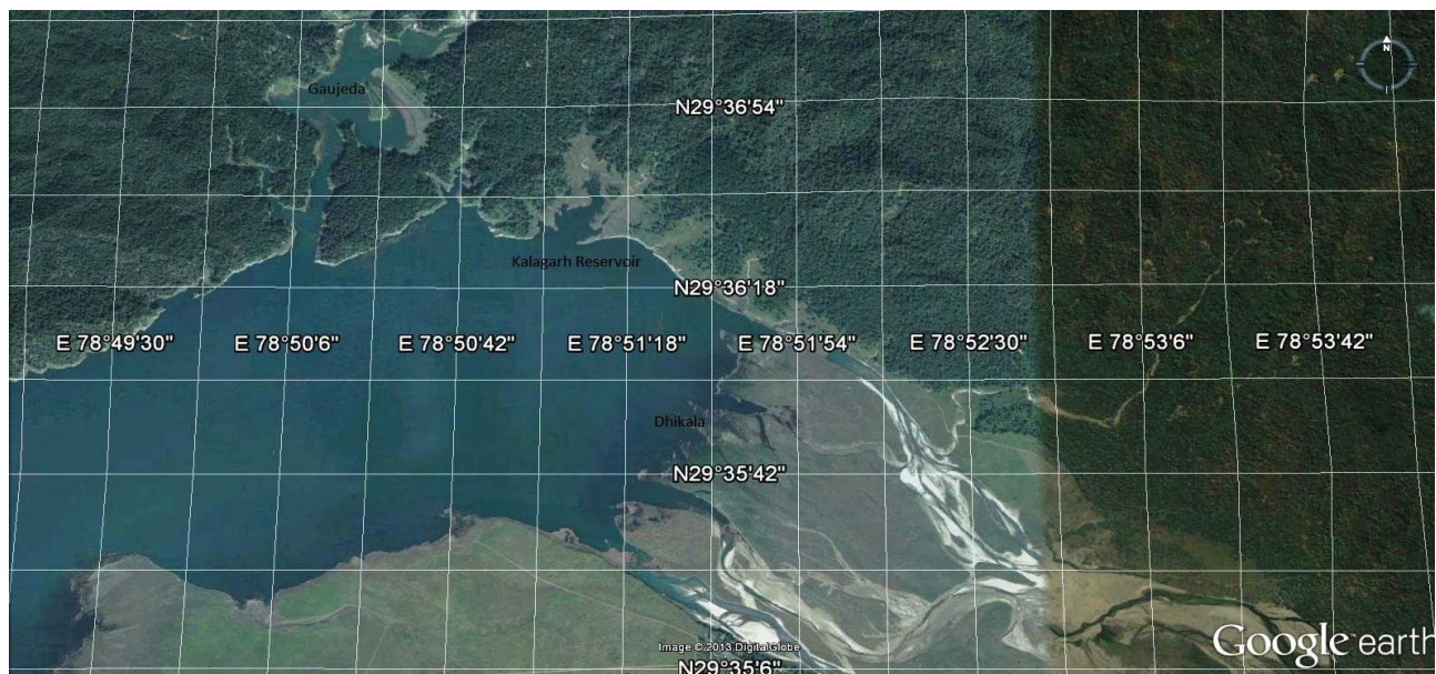
Map 4. Areas surveyed for Gharial 2013, in Dhikala, CTR.