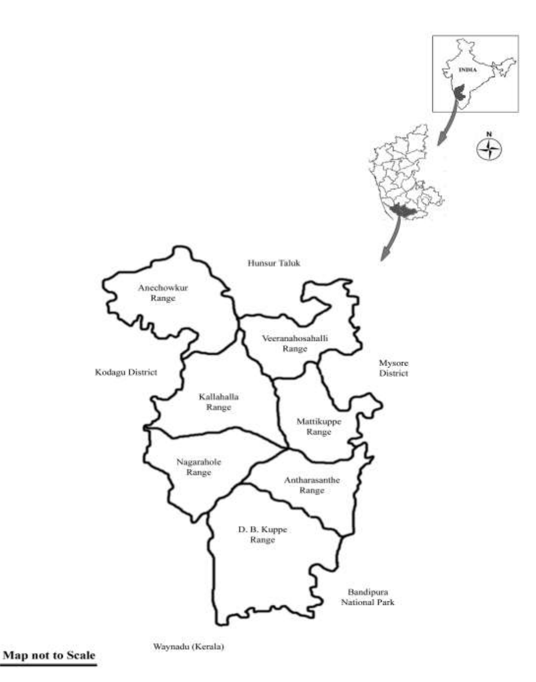
Figure 1. Map showing the study areas at Nagarahole National Park.

J<sup>1</sup>. Further, \beta (beta) diversity of butterflies was calculated by using Sorensen's Index. It is a simple method used to identify the beta ( \beta ) diversity and indicates the similarity of species distribution within the study sites. Sorensen's Similarity Index is defined as: