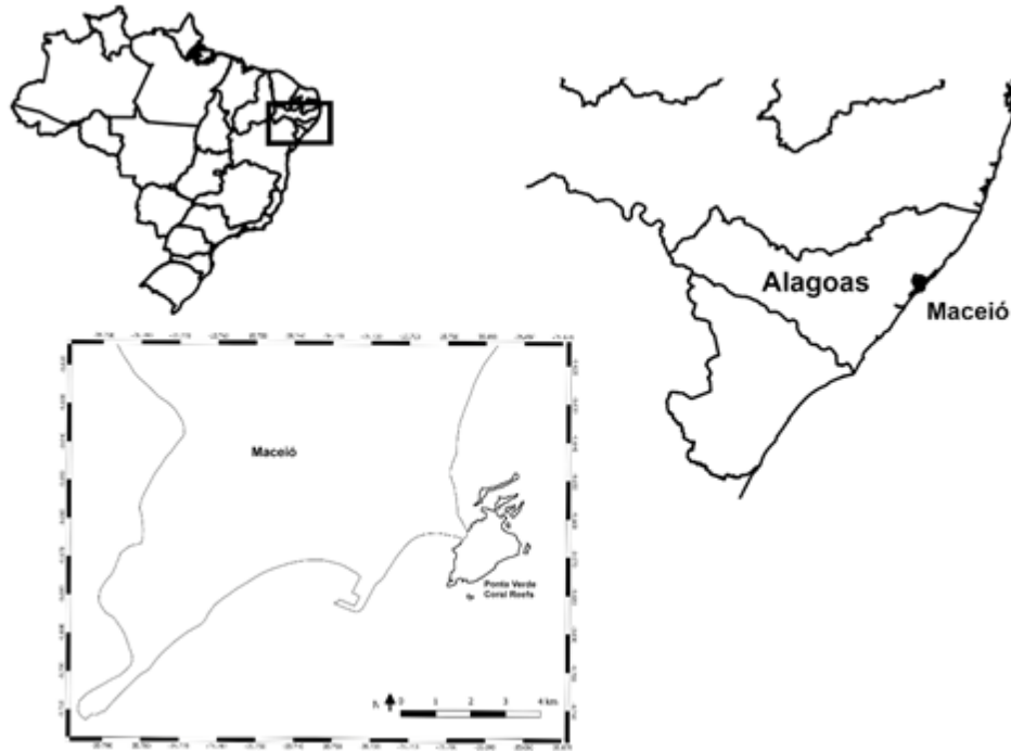
Figure 1. Location of the study site.

billion tonnes of plastic garbage had been discarded in the environment, with a majority being of single use goods (Geyer et al., 2017).