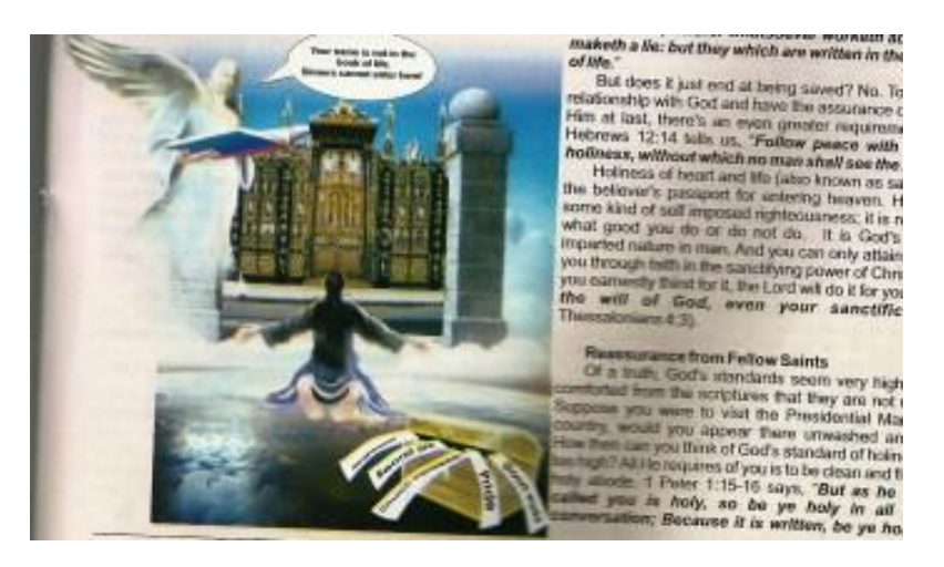
Figure 4. The image of an angel who opens a very big book.

effectively communicated into the psyche of all viewers/ readers the process of the event that will mark the end of all existence in this realm. This is corroborated by Kress and Van Leeuwen when they assert that: