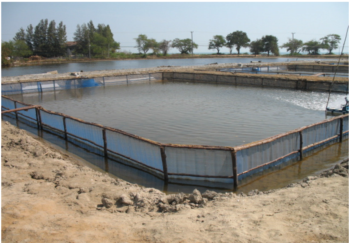
Figure 2. Grow out of B. areolata to marketable sizes using large-scale earthen ponds of 20.0x19.0x1.2 m.