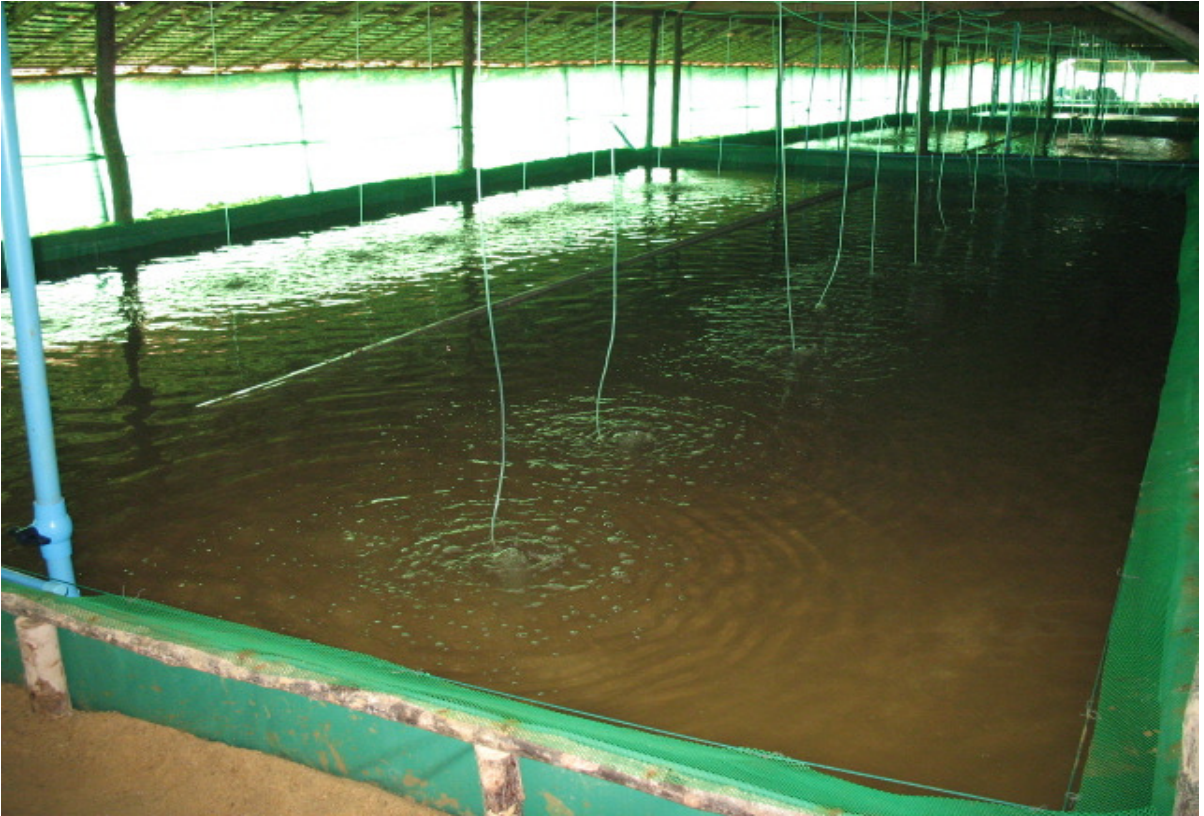
Figure 1. Grow out of B. areolata to marketable sizes using large-scale flow-through canvas ponds of 6.0x12.0x0.4 m.