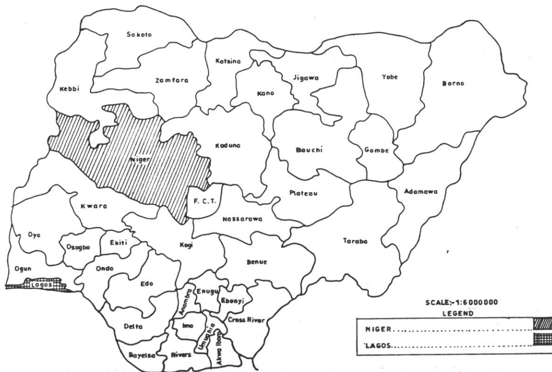
Figure 2. Map of Nigeria showing the study areas: Niger and Lagos States.

employment (Welcomme and Kapetsky, 1981; Hem and Avit, 1996).