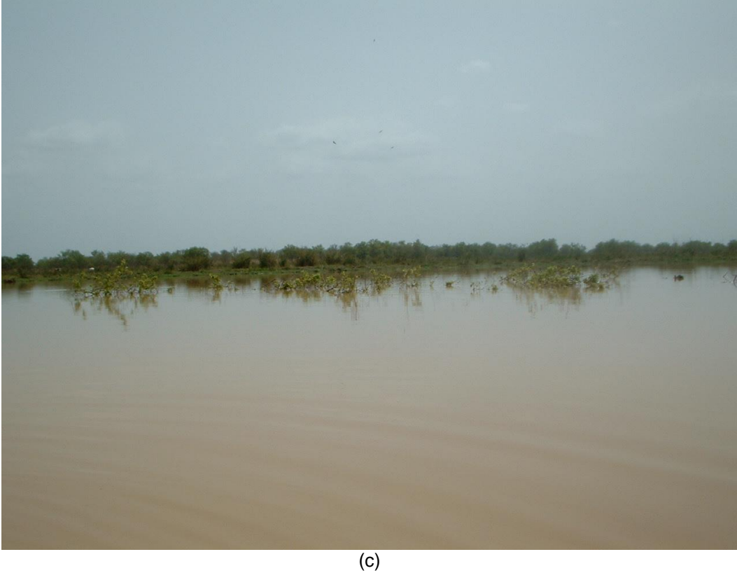
Figure 1. Types of brush parks in Niger and Lagos States. (a) Brush park constructed of branches of Avicennia marina in Lagos Lagoon; (b) Brush park constructed of palm fronds ( Elaies guineensis ) in Badagry creek, Lagos and (c) Brush park constructed of branches of Mitragyna inermis in an ox bow lake near Dangi village, Mokwa local government area of Niger State, Nigeria.

The branches are placed in water to form aggregations, which are removed after a short lapse of time, together with any fish that may have sought shelter amongst them. Installations of this type may be considered as refuge traps that exploit fish stock in the open waters in which they are placed, or which draw fish from the cover of adjacent reed-beds. In some coastal lagoons, however, the use of larger semi-permanent parks has been