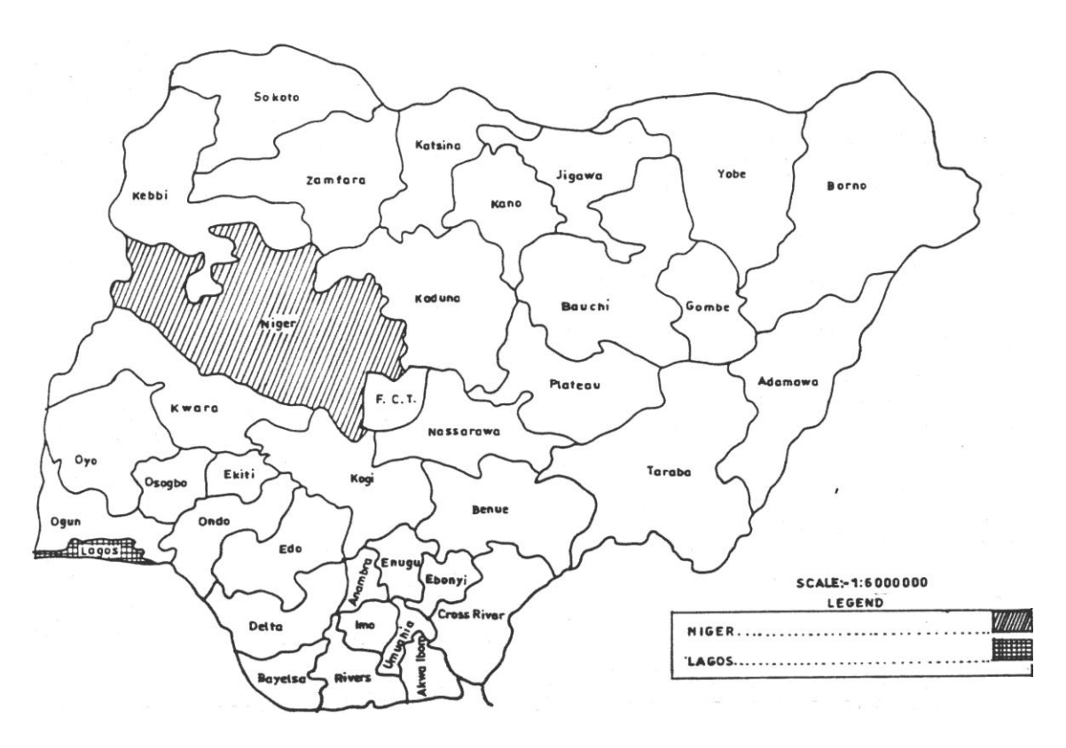
Figure 2. Map of Nigeria showing the study areas: Niger and Lagos States.

employment (Welcomme and Kapetsky, 1981; Hem and Avit, 1996).