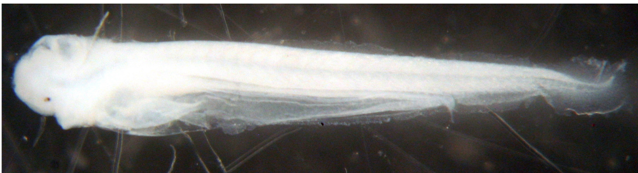
Figure 2. Newly hatched larvae of L. parvus after 20 h post-hatching.