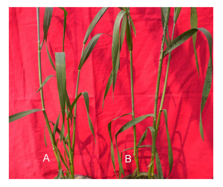
Figure 2. Resistance of wheat-rye amphiploids to R. padi. (A) MK09S1-2 displaying high level of resistance. (B) MK09S1-7 displaying high susceptibility.