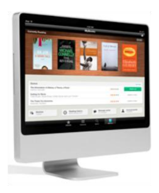
Figure 1. M™ cloud library design.

and Web technologies in libraries, users' information requirements are increasingly personalized. And now more and more libraries advocate User-centered services. And only in this way, can they master the basic demands of their users. Furthermore, the library can develop itself according to such information and improve users' satisfaction. Farkas (2007) said web collaboration allows for libraries to be able to go to places where the patrons are and deliver relevant services where and when users need them.