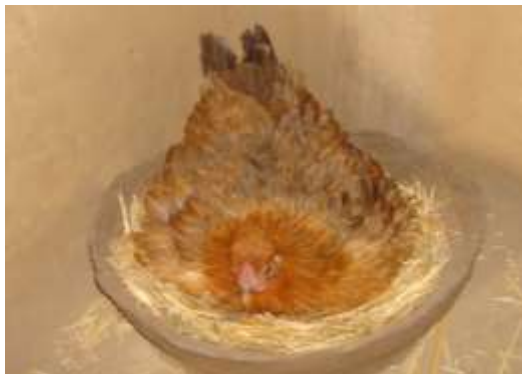
Local broody hen