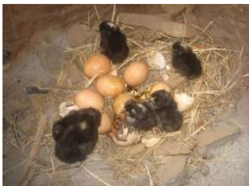
Naturally hatched Koekoek chickens