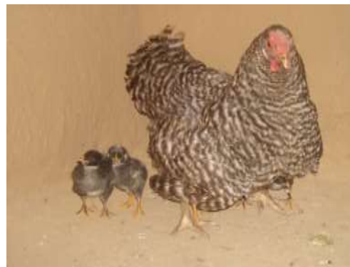
Koekoek hen gives heat to her babies