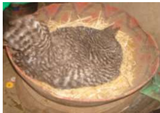
Koekoek broody hen