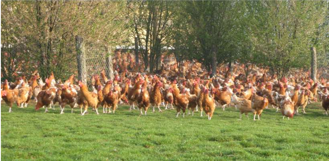
Figure 3. A typical free range layers production system practiced in Brazil. The chicken presented in this picture represent tropically adapted breed called Embrapa 051.

the nearby households. None of the households participated in this study practiced record keeping, which is in agreement with previous findings in other African countries (Muchadeyi et al., 2009).