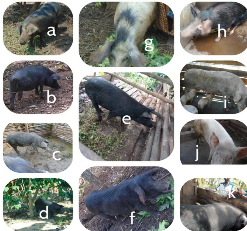
Figure 2. a-f: locally adapted pigs are small bodied and primarily characterised by black colour, or black and white together; g and h: Cross breeds are characterised by a mix of different colour combinations i-Camborough; j: Large White; k: Landrace are purely white coloured, have large body sizes at maturity and are differentiated by body shape and ear orientation.

Source: Photos: Jackline Kampire/Mbarara University of Science & Technology (MUST) (taken between Jan- Dec 2021) (Author's personal collection)