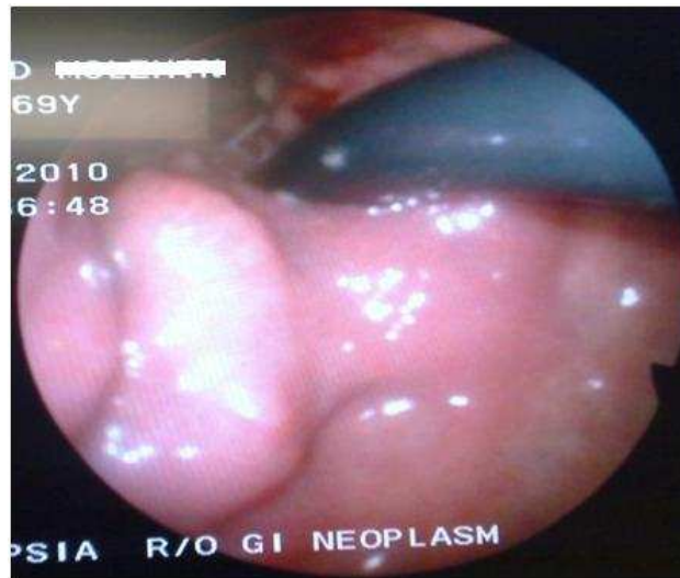
Figure 1. Esophagogastroduodenoscopy retroflexed view from within the stomach shows a large, irregular, ulcerated mass in the gastric cardia.