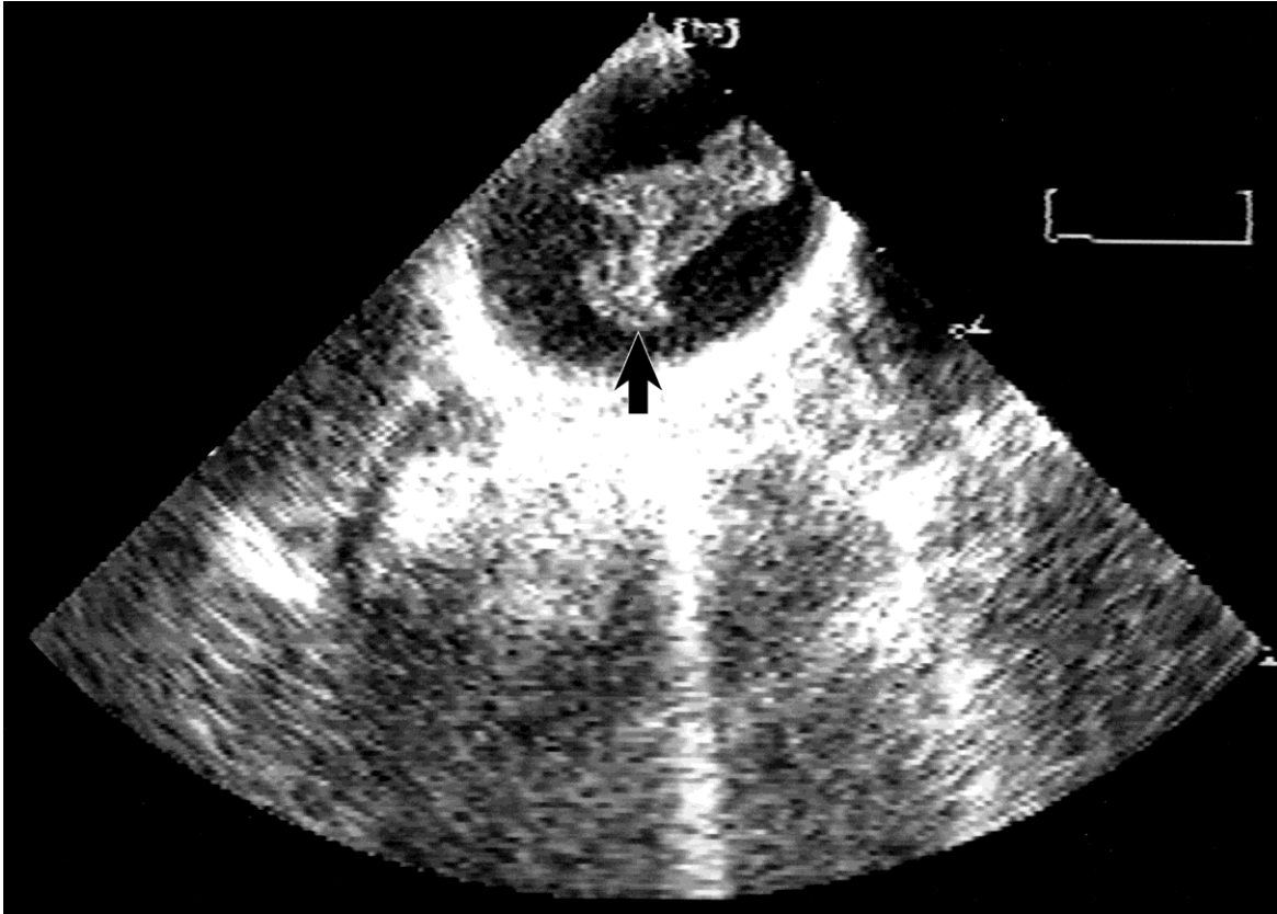
Figure 1. Transesophageal echocardiography long-axis view of the aortic arch showing large mobile thrombus along aortic wall.

United States (US) survey was 28.4% (Chang et al., 2009). In that study, the incidences across racial categories were 31.1, 17.9 and 18.8%, in White, Black, and Mexican American, respectively. In contrast, a study reported by Saltanpour et al. (2011) found the MTHFR allele in more than 38% of Iranian subjects irrespective of the presence of venous thrombosis.