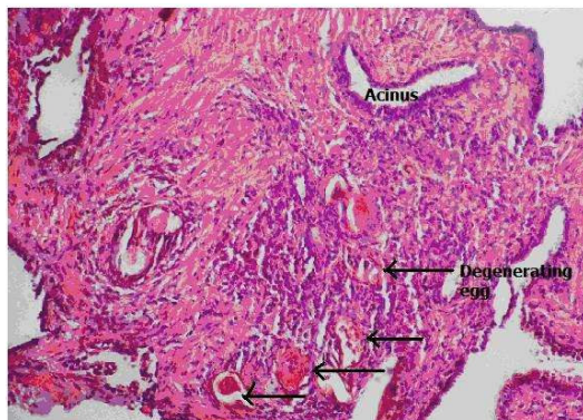
Figure 2. Showing some degenerating ova (arrows) with aggregates of mixed inflammatory cells. Several benign acini lined by columnar epithelium are present in this field. (H and E) stains. 20X objective.

17.11 ng/mL, which is high for age/assumed prostatic volume. A working diagnosis of nodular hyperplasia was made to rule out malignancy. After some preliminary laboratory tests were done to establish the patient's haematological and renal function status which were essentially normal, a tru cut biopsy of the prostate was done using the trans-rectal approach. Three cores of grayish white specimen were obtained and sent to the histopathology laboratory.