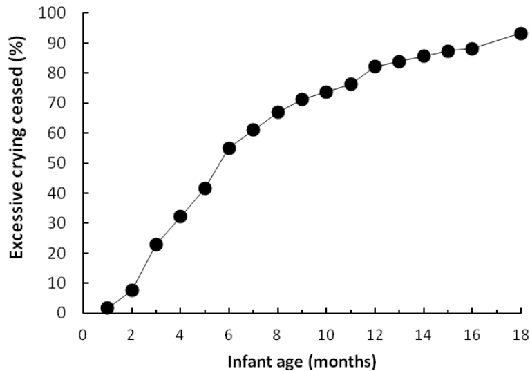
Figure 2. Cumulative percentage of infants that ceased colicky and excessive crying behaviours with age (months) based on 154 New Zealand cases.