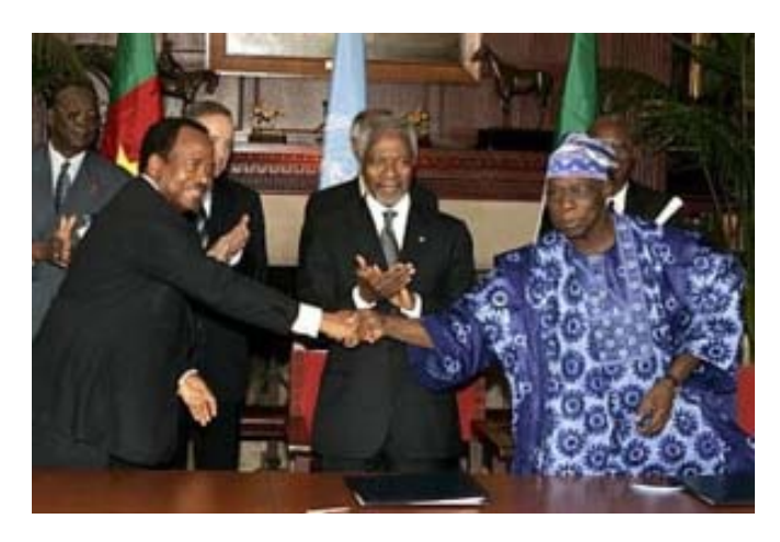
Figure 2. The Green Tree "Handshake".Note: Paul Biya (left), O. Obasanjo (right) and Kofi Annan (UNO, Secretary General, middle) during the signing of the Green Tree Accord.

the two parties met at the Green Tree Estate in Manhasset, New York, where they concluded the "Green Tree Agreement" (see plate 1) and the handing over ceremony to be done in front of UN officials and diplomats from numerous countries. Nigeria was given 60 for its forces to quit the disputed peninsula (UN News Service, 2011) (Figure 2).