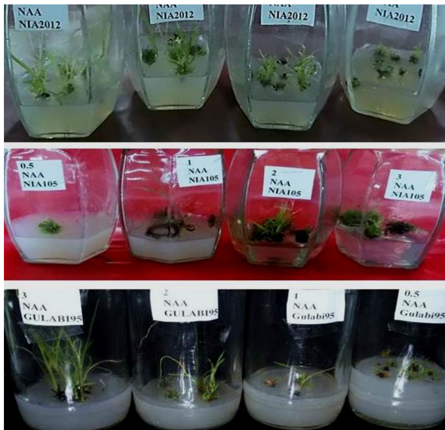
Figure 1c. Effect of different concentration of NAA (cytokinin) on regeneration of plantlets.