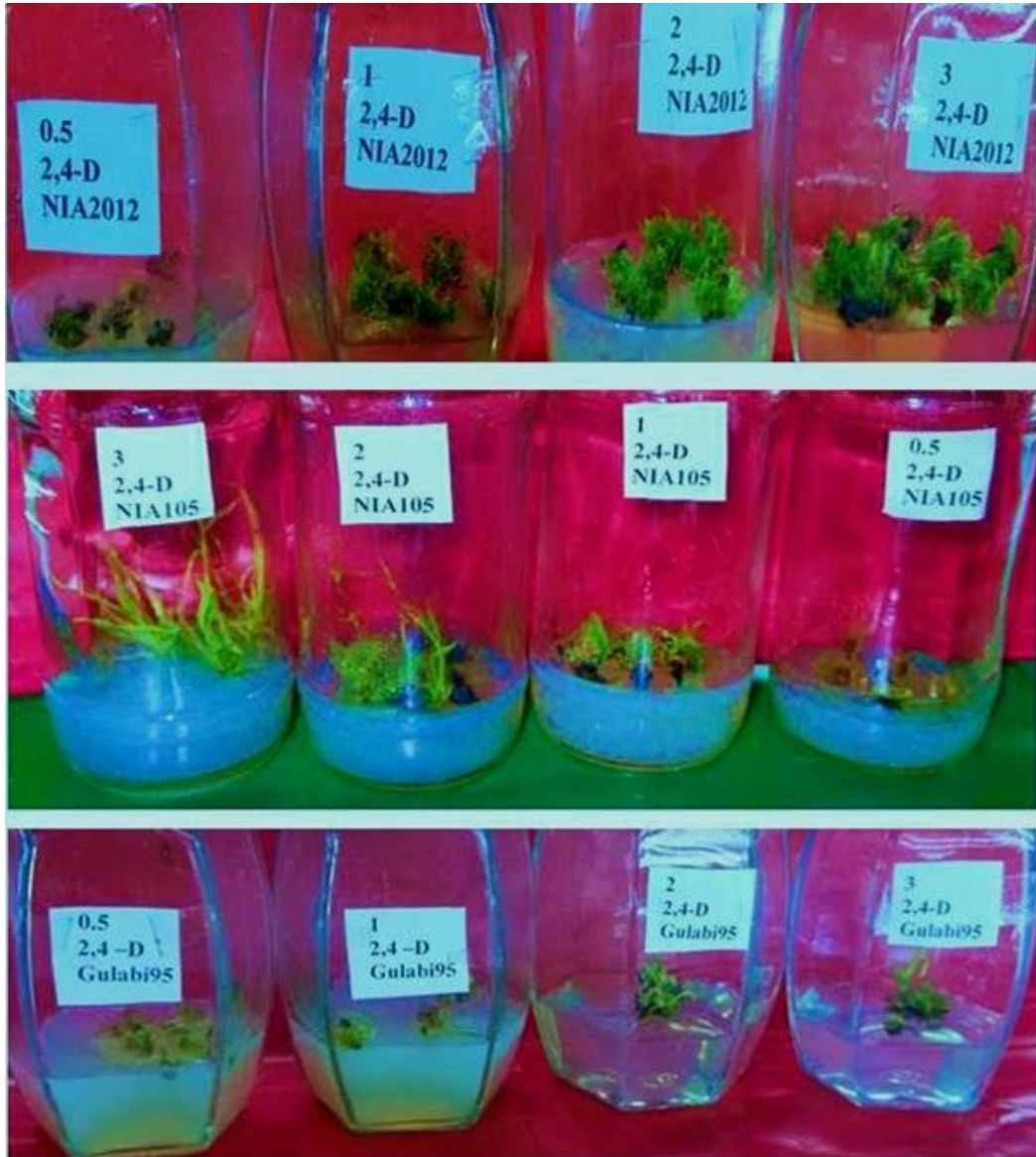
Figure 1a. Effect of different concentration of 2, 4-D (cytokinin) on regeneration of plantlets.

study also demonstrates the outcome of phytohormone for shoot formation and multiplication described positive correlation (Rocha, 2012). All the results are consistent with that of Torque et al. (2010) Sughra et al. (2014) and Solangi et al. (2016). The current study is quite different due to change in the variety or concentration of hormones (Roy and Kabir, 2007; Duminil and Di Michele, 2009).