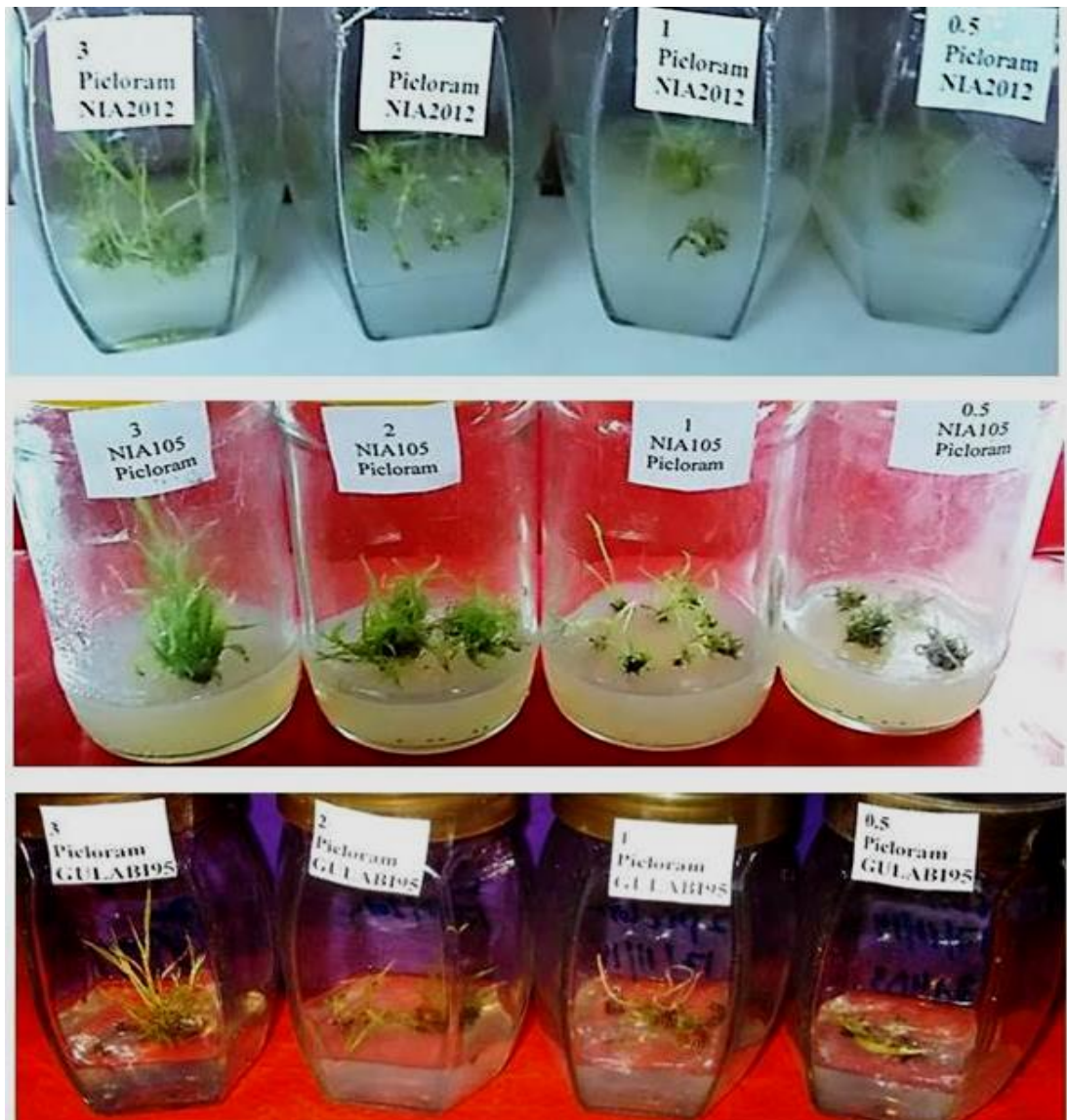
Figure 1b. Effect of different concentration of picloram (cytokinin) on regeneration of plantlets.