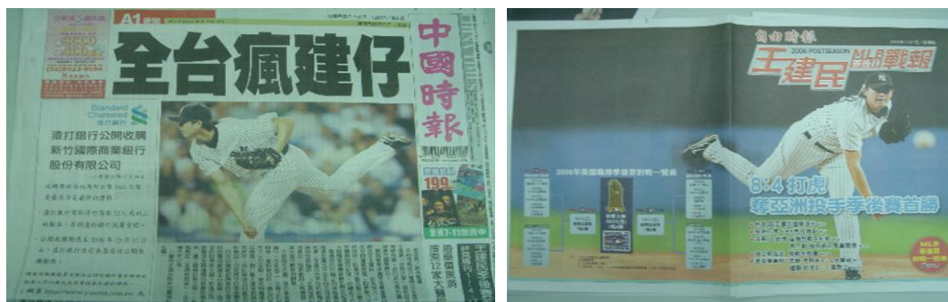
Figure 2. Framed coverage on unique stories of Chien-Ming Wang. Information source: http://blog.chinatimes.com/alex/gallery/1594.html ).

and pay attention to everything related to him.”