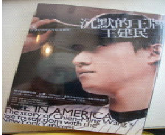
Figure 4. A book about Chien-Ming Wang. Information source: http://www.wretch.cc/blog/yijia&article_id=6863343 .

market their commodities through image of the athlete and this behavior will help this athlete being more popular.