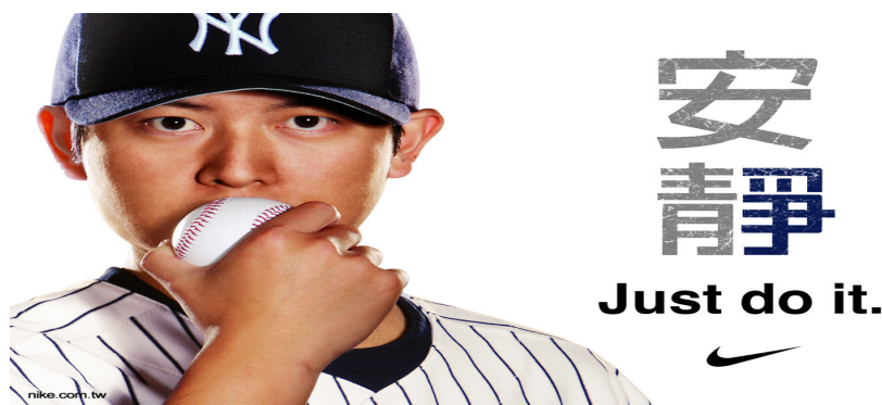
Figure 3. Chien-Ming Wang's endorsement for Nike. Information source: http://www.nike.com.tw/justdoit/download/wangpaper/1024/1024x7681.jpg .