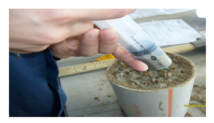
Figure 2. Rheocem injections into soil sample.