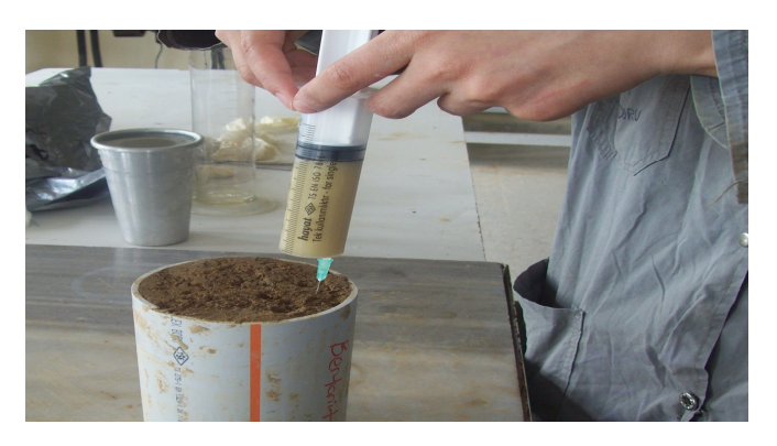
Figure 1. Bentonite injection into soil sample.