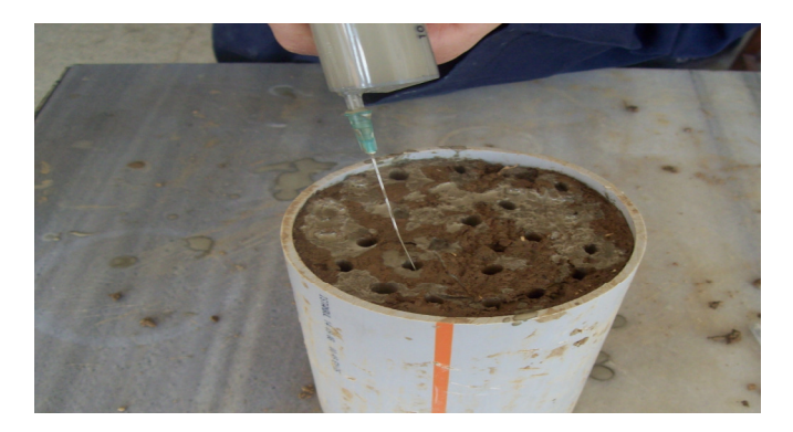
Figure 3. Injection of bentonite + rheocem into soil sample.

prepared by using 100 g bentonite, 1400 ml water, and 3 g rheobuild100. The sample was acquired with a PVC pipe (polyvinyl chloride) of 214 g empty weight. The net weight of the sample was 2650,7 g. Into this soil sample, 159 g of suspension prepared with bentonite, weighting to 6% of the sample, was injected as shown in Figure 1.