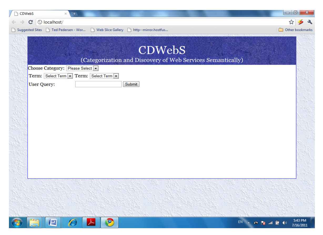
Figure 3. Front end of the proposed framework where the service discoverer has the option of selecting a category from the set of categories presented in the form of a drop down list.

Figure 2. The average precision at n for different values of n are indicated by the bar chart which shows that precision rate is quite high when discoverer opts for finding Web services with categorization compared to using Web services without categorization.