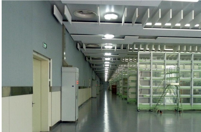
Figure 1. Ecophon acoustic panels installed on the ceiling and walls.