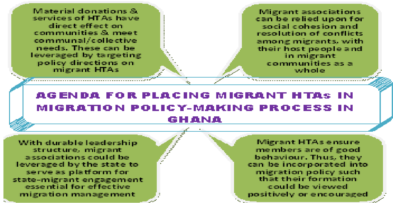
Figure 2. A summary model for placing migrant HTAs in migration policy discourse.

various institutions in Ghana (Owusu, 2000:1174) for collective effect.